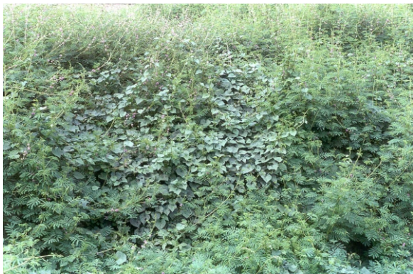
Mimosa overgrowing Mikania

Seed dispersal: Seed dispersal is through running water, carried in animal fur, clothing, vehicles, agricultural implements and machinery and as a contaminant of soil or the seeds of crop plants. Dry heat promotes the germination of seeds. Seeds are known to lie dormant up to 50 years.