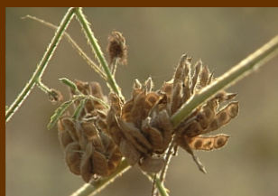
Pods of Mimosa