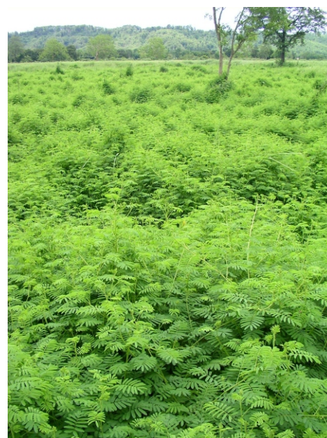
Mimosa infestation in Assam, India

Biological: Several natural enemies of the weed have been reported from its natural range. A sap-feeding bug from Brazil, Heteropsylla spinulosa (Homoptera: Psyllidae), that causes growing tip distortion and reduces seed production in Mimosa was introduced in Queensland (Australia), Fiji and Papua New Guinea with some success. Corynespora cassiicola , a cosmopolitan fungus, causes stem spot, defoliation and dieback of Mimosa in Queensland and Papua New Guinea. The fungus can be very damaging under hot humid weather conditions. A coreid bug, Scamurius sp., that feeds on the Mimosa shoots inhibiting vegetative growth and flowering was introduced from Brazil to Queensland and Western Samoa but did not establish. Host specificity of a moth viz., Psygyda walkeri , which feeds on the leaves, flower buds, tender seedpods and tender stems of Mimosa in Brazil and Colombia was tested on 110 plant species from 29 families including Mimosaceae. Twenty-nine of these plant species supported some degree of larval feeding. Further