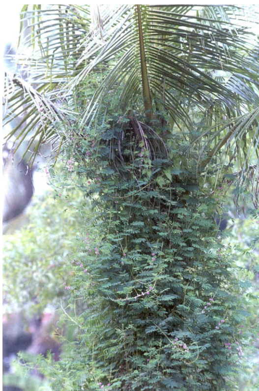
Mimosa smothering coconut palm, Kerala, India

Uses: It is used as nitrogen fixing cover crop and green manure in several countries in the Asia-Pacific region. The spineless variety is an excellent soil improver and soil binder. In Indonesia, the plant is used as a fodder to buffaloes.