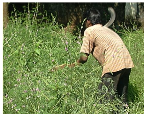
Sickle weeding of Mimosa thicket

studies are in progress. Pathogenic fungi isolated from the weed including Cercospora canescens , Fusarium sp. and Uredo mimosae- invisae are yet to be tested for host specificity. Fusarium pallidroseum , a fungus isolated from diseased M. diplotricha in the Philippines, provided excellent control of Mimosa seedlings when sprayed with crude culture filtrate or cell free filtrate. Further studies are warranted before recommending use of the fungus to control Mimosa.