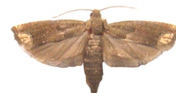
Epiblema strenuana -adult

the year would be more helpful in managing the weed. Attempts need to be made to assess the potentials of indigenous insects.