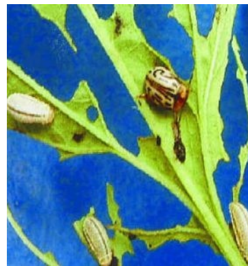
Damage caused by Z. bicolorata on Parthenium

biocontrol agent like Z. bicolorata may not be sufficient to manage the weed since its population build up is restricted to July-September, whereas Parthenium can germinate throughout the year. Therefore, insects, which remain active during most of