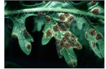
Leaf infected by Puccinia melampodii

biocontrol agent like Z. bicolorata may not be sufficient to manage the weed since its population build up is restricted to July-September, whereas Parthenium can germinate throughout the year. Therefore, insects, which remain active during most of