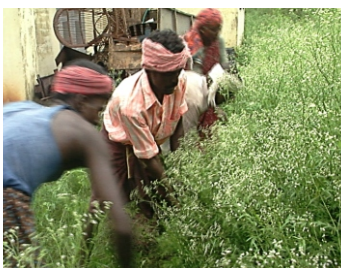
Mechanical removal of Parthenium

Uses: Parthenium is reported to have insecticidal, nematicidal and herbicidal properties. It is also used for composting. The odour of the plant is apparently disagreeable to bees and they can be easily kept away by carrying a handful of Parthenium flower heads. A root decoction of the plant is used in treating amoebic dysentery. Sub-lethal doses of parthenin, a toxin recovered from Parthenium, exhibited antitumor activity in mice and the drug can either cure mice completely or increase their survival time after they had been injected with cancer cells. Parthenin is also found to be pharmacologically active against neuralgia and certain types of rheumatism. In the Caribbean and Central America, Parthenium is applied externally on skin disorders and a decoction of the plant is often taken internally as a remedy for a wide variety of ailments. In Jamaica, the decoction is used as a flea-repellent both for dogs and other animals.