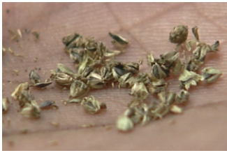
Seeds of Parthenium

Threat and damage: Infestation by Parthenium degrades natural ecosystems. It aggressively colonizes disturbed sites and reduces pasture growth and depresses forage production. Its pollen is known to inhibit fruit set in many crops. The germination and growth of indigenous plants are inhibited by its allelopathic effect. In man, the pollen grains, air borne pieces of dried plant materials and roots of parthenium can cause allergy-type responses like hay fever, photodermatitis, asthma, skin rashes, peeling skin, puffy eyes, excessive water loss, swelling and itching of mouth and nose, constant cough, running nose and eczema. In animals, the plant can cause anorexia, pruritus, alopecia, dermatitis and diarrhea. Parthenium can taint sheep meat and make dairy milk unpalatable due to its irritating odour. In Queensland, Australia, losses to the cattle industry due to Parthenium have been estimated to be Au$ 16 m per year in terms of control costs and loss of pasture. In India, an extensive outbreak of weed dermatitis caused by Parthenium allergy involving around 1,000 patients and including some deaths has been reported.