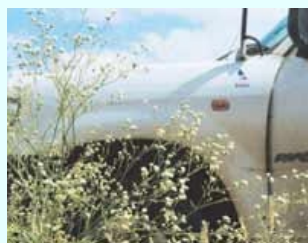
Seed dispersal by vehicles