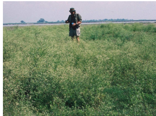
Infestation by Parthenium in an agricultural field

Mode of Infestation: Parthenium colonizes disturbed sites very aggressively, impacting pastures and croplands by outcompeting native species. The allelopathic effect, coupled with the absence of natural enemies like insects and diseases, is responsible for its rapid spread in its introduced ranges. Growth inhibitors like lactones and phenols are released from this plant into the soil through leaching, exudation of roots and decay of residues. These growth inhibitors suppress the growth and yield of native plants.